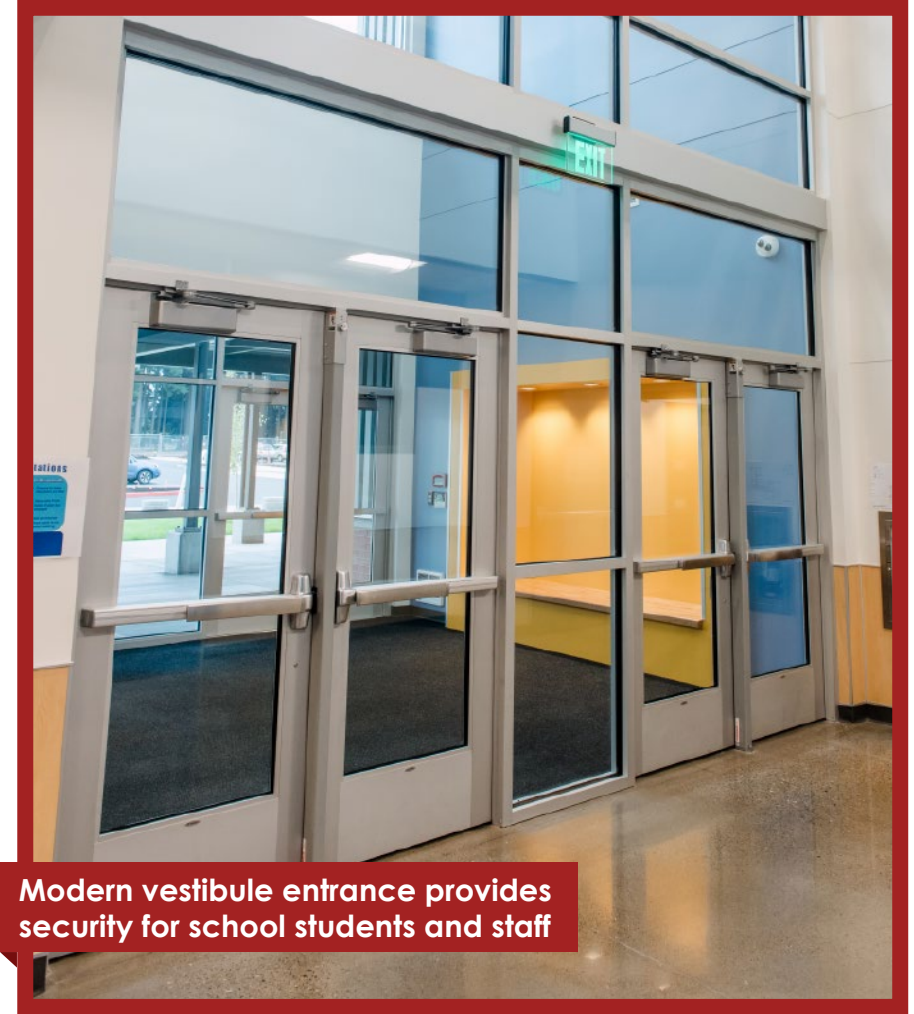
Modern vestibule entrance provides security for school students and staff