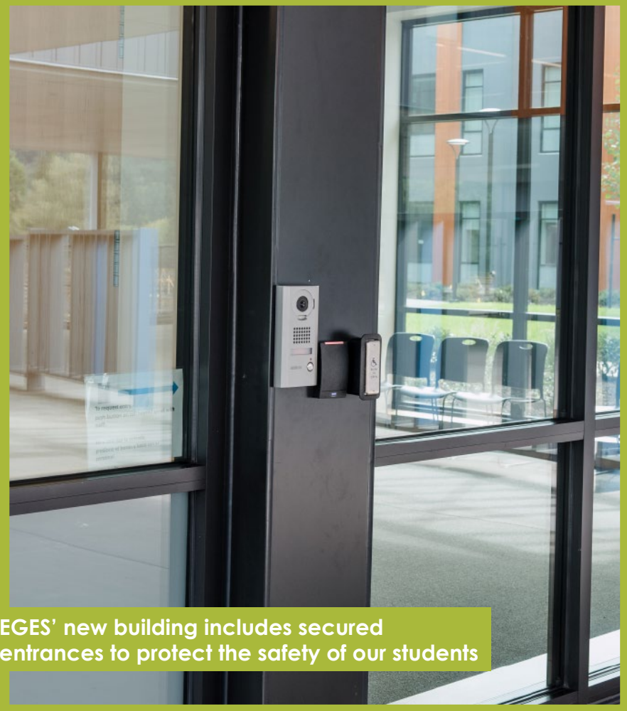
EGES' new building includes secured entrances to protect the safety of our students