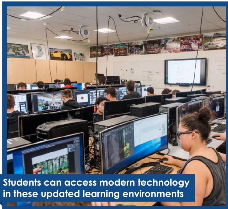
Students can access modern technology in these updated learning environments