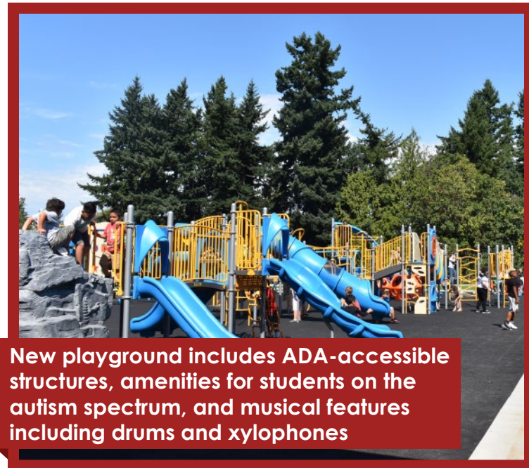
New playground includes ADA-accessible structures, amenities for students on the autism spectrum, and musical features including drums and xylophones