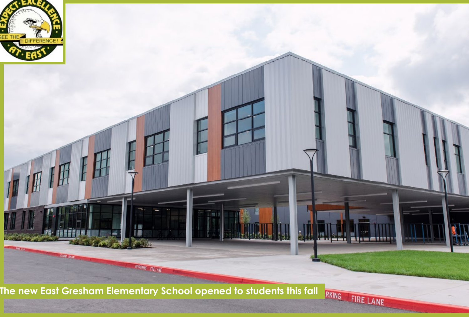
The new East Gresham Elementary School opened to students this fall