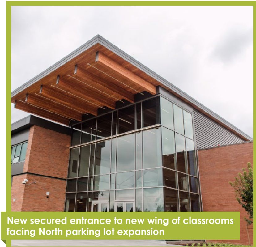
New secured entrance to new wing of classrooms facing North parking lot expansion