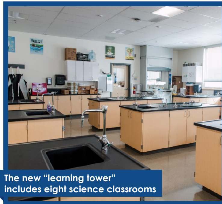
The new "learning tower" includes eight science classrooms