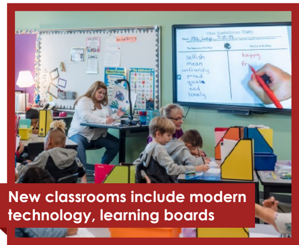
New classrooms include modern technology, learning boards