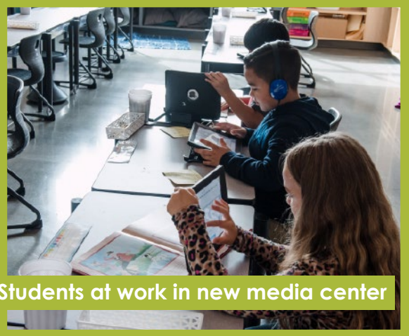
Students at work in new media center