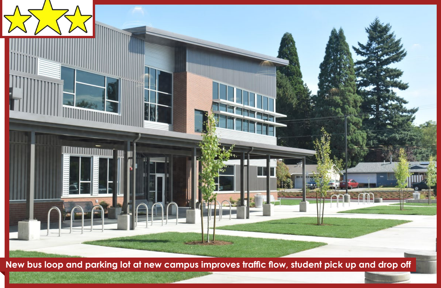
New bus loop and parking lot at new campus improves traffic flow, student pick up and drop off