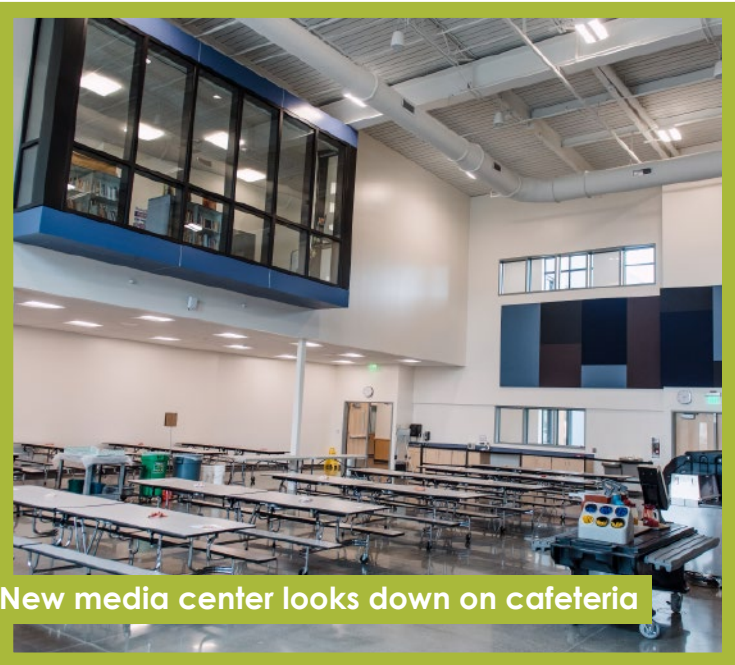
New media center looks down on cafeteria