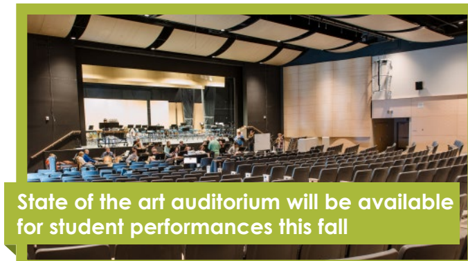
State of the art auditorium will be available for student performances this fall