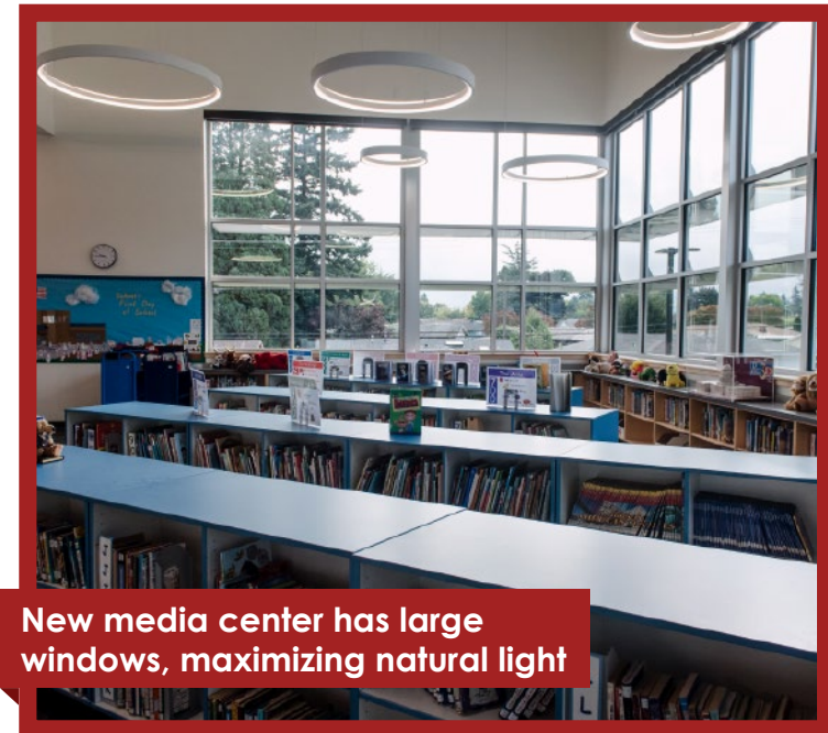
New media center has large windows, maximizing natural light